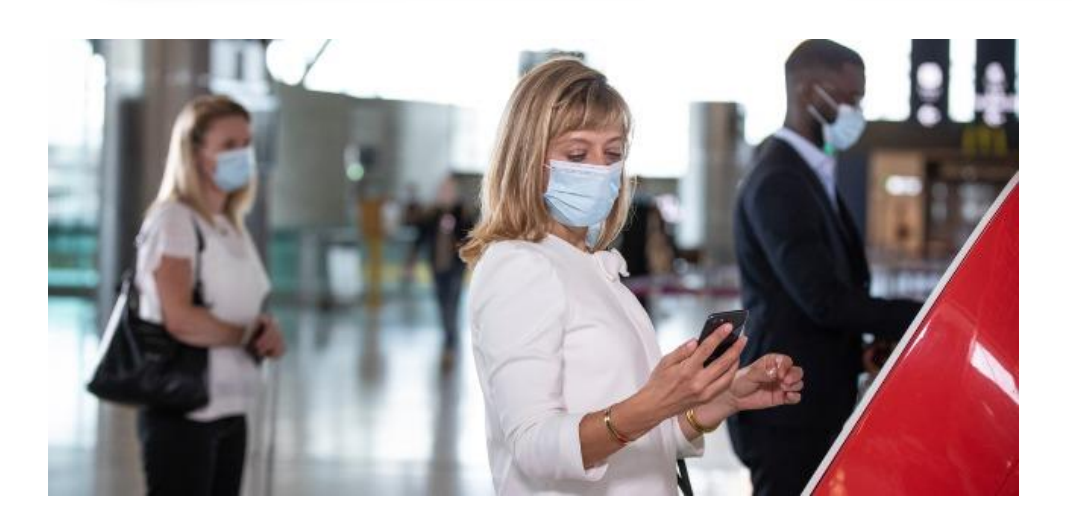
Travel prepared with Air France and KLM